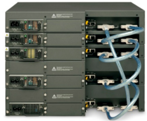
ERS 5600 Stacking Cable Interconnection

From a management perspective, our Stackable Chassis appears as a single networking entity - utilizing only a single IP Address. This can significantly reduce the number of switches to be managed within the network as a stack of up to 8 switches can be managed just as easily as a single switch. Distributed real-time monitoring of the Stackable Chassis also provides an at-a-glance view of operational status and health which